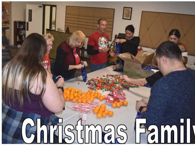
Christmas Family Night